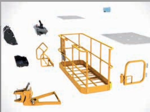
Easily removable modular basket and hood.