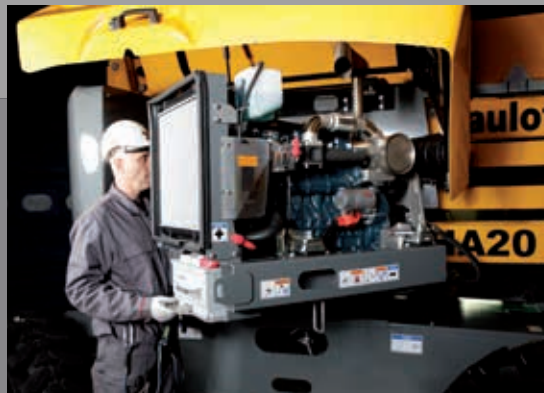
Swing out engine tray enabling direct access to key components.