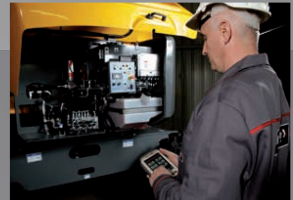
Haulotte Diag system designed to provide a complete and immediate diagnosis, in the workshop or on-site.